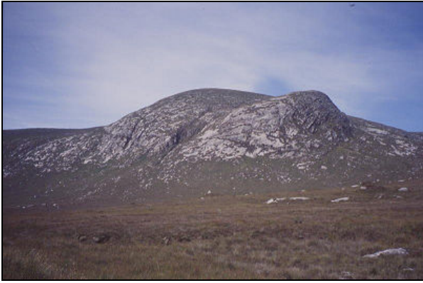
Figure 6: Slieve Snaught in the Derryveagh Mountains, Donegal. The knob of rock on the right flank of the mountain is a striking roche moutonnée. Ice flow was from left to right.