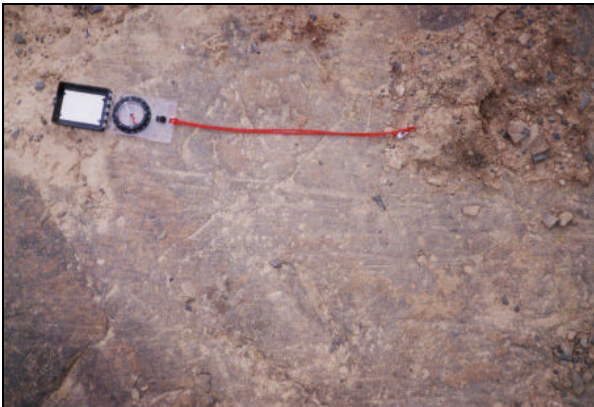
Figure 5b: Striae at Mandistown, north Meath