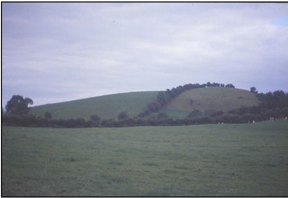
Figure 7: A drumlin at Aclare in north Meath. Flow was right to left, note the streamlined shape of the hill.