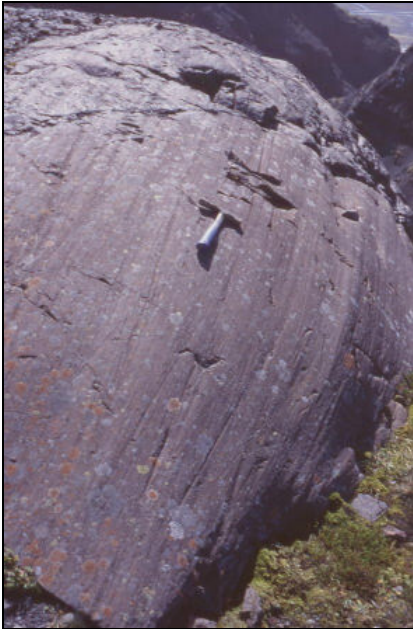
Figure 5a: Striated rock outcrop in Iceland