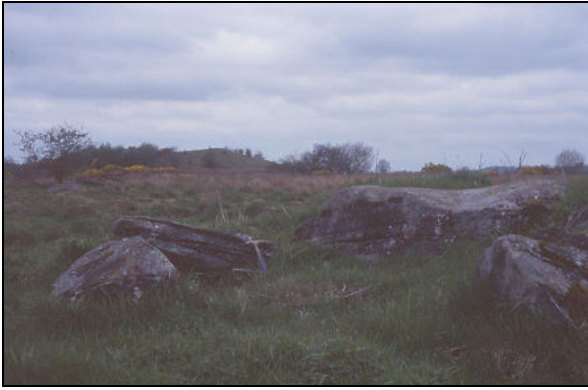
Figure 2: Erratics of sandstone in area of limestone bedrock, Oldcastle, County Meath.