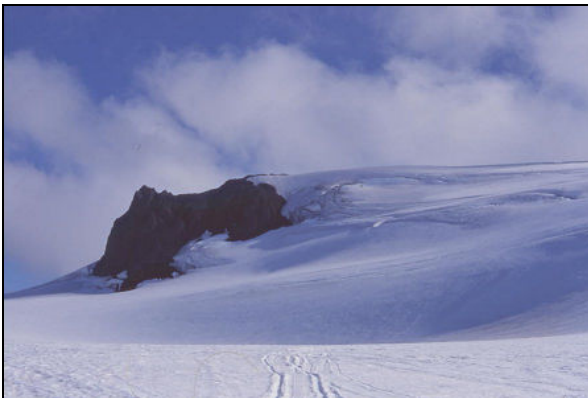
Figure 3: Nunatak protruding above Vatnajokull Ice Sheet, Iceland.